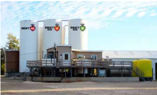
Liquid Headquarters: Pleasantville, Iowa

Drive on a wintry roads treated with salt and your car becomes covered in the corrosive white salt. What is not seen, and is even worse, is that the chemical nature of nearly all anti-icing and deicing products accelerates metal corrosion on bridges, damages vegetation and becomes less effective once the temperature lowers.