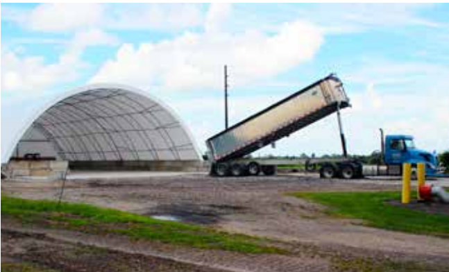
Salt Headquarters: Pleasantville, Iowa

Drive on a wintry roads treated with salt and your car becomes covered in the corrosive white salt. What is not seen, and is even worse, is that the chemical nature of nearly all anti-icing and deicing products accelerates metal corrosion on bridges, damages vegetation and becomes less effective once the temperature lowers.