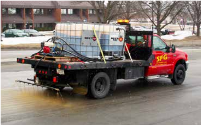
Applying BEET 55 Plus RTU

SFG has the capability of blending different products to customer's request. This allows the customer to have a product tailored to meet their needs.