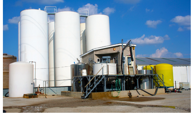
Liquid Headquarters: Pleasantville, Iowa

Drive on a wintry roads treated with salt and your car becomes covered in the corrosive white salt. What is not seen, and is even worse, is that the chemical nature of nearly all anti-icing and deicing products accelerates metal corrosion on bridges, damages vegetation and becomes less effective once the temperature lowers.