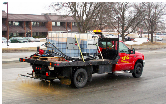
Applying Husker Plus RTU

BEET 55™ Complete and HUSKER PLUS™ RTU (These are our most popular blends)