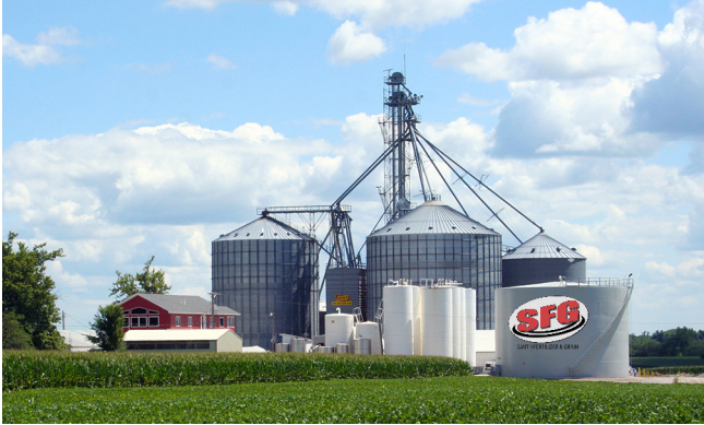
Corporate Office: Knoxville, Iowa

Drive on a wintry roads treated with salt and your car becomes covered in the corrosive white salt. What is not seen, and is even worse, is that the chemical nature of nearly all anti-icing and deicing products accelerates metal corrosion on bridges, damages vegetation and becomes less effective once the temperature lowers.